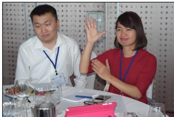
The consultation discussed promoting marginalised women’s empowerment with significant insights from the Vietnam Association for Education for All (VAEFA) in collaboration with Hanoi Association for the Deaf.

Participants at the regional consultation deliberated on how to better engage youth and students to strengthen the education movement: The youth movement can be expanded by mobilising and engaging youth in policy discussions on education. They can be strengthened by being offered spaces to interact with each other openly and meaningfully. The youth must be provided opportunities and trainings to further enhance their skills. Providing education opportunities through formal and non-formal means is an important aspect which will allow the youth movements to grow exponentially.