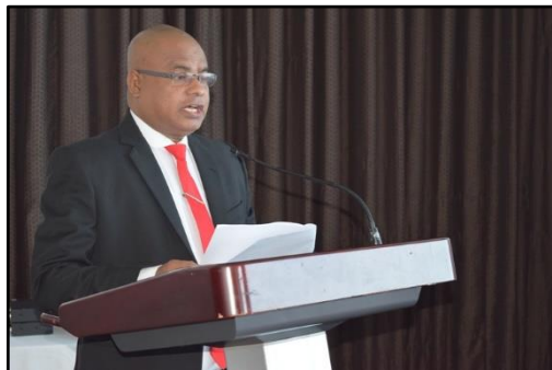
The regional consultation was formally inaugurated by Sunil Hettiarachchi, Secretary, Ministry of Education in Sri Lanka, who highlighted that education is necessary for harmonious human development.

The Consultation also aimed to provide a platform for ASPBAE's members and partners to update on ASPBAE advocacy plans and strategies (2017-2020) and plan for coordinated action. More specifically-