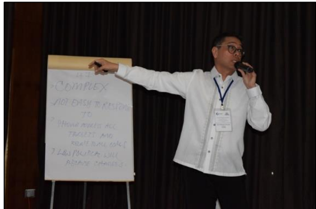
Jose Roberto Guevara, ASPBAE's Immediate Past President, led a session on SDG 4.7 where he stressed that many of its core elements, including human rights, gender equality, and health and well-being, are already embedded in national education policies.

Robbie stressed that many of the core elements of SDG 4.7, including human rights, gender equality, as well as health and well-being, are already embedded in national education policies. The target, therefore, is concerned not only with acquisition of subject knowledge, but also the development of social and emotional skills needed to apply this knowledge. In the discussion, it was highlighted that SDG 4.7 must be mainstreamed and operationalised from early childhood through higher education and in non-formal education for children, adolescents, youth, and adults. It also recognised the importance of partnership and multi-sectoral cooperation in achieving SDG 4.7. Essentially, governments are the ultimate duty-bearers with an obligation to ensure appropriate policies and adequate resources.